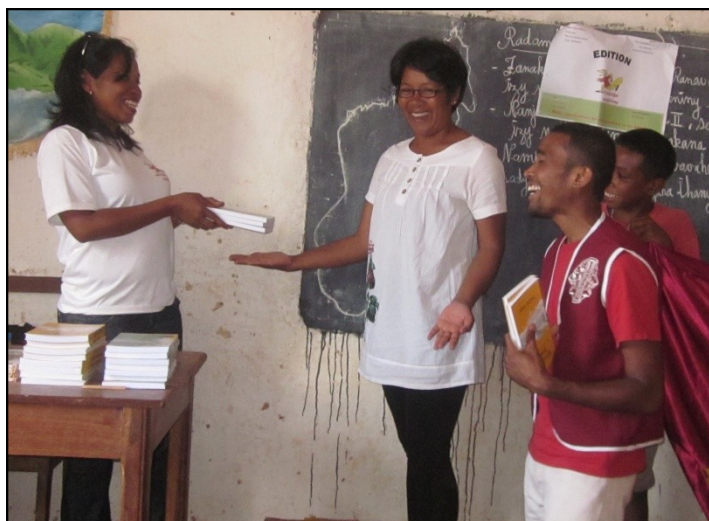
The director of the orphanage Henintsoa receives books from Vakoka Vakiteny in the presence of the students from the Leo Club (right in the picture) and the residents of the orphanage.

The students at the private universities in Antsirabe have together formed a nonprofit club called Leo Club and they have newly started a fruitful cooperation with Vakoka Vakiteny. After having heard of our books they requested some copies of children's books from us. Although we gladly provided them, we did not know exactly what they would use them for. It was therefore a great surprise when it turned out that they, on the basis of some of the stories, had made children's theater plays they intend to perform at schools!