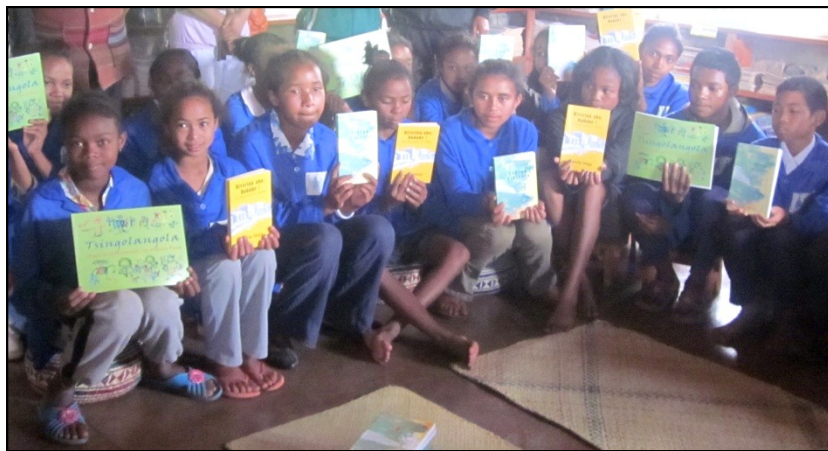
Above: Some of the children from the SOS children's village with the books they had received.